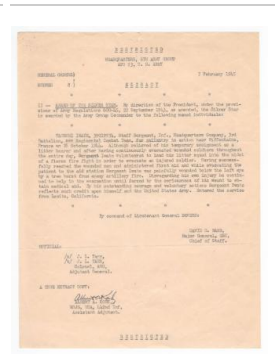
Title: document Date: 1945 Medium: paper