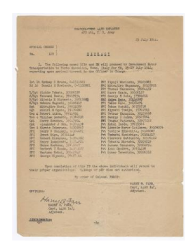
Title: form, document Date: 1944 Medium: paper