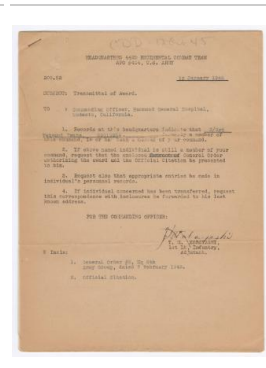
Title: letter, envelope Date: 1946 Medium: paper