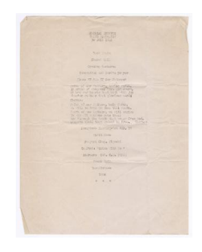
Title: program Date: 1944 Medium: paper