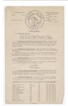
Title: bulletin Date: 1943 Medium: paper