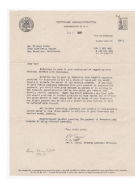
Title: letter Date: 1946 Medium: paper