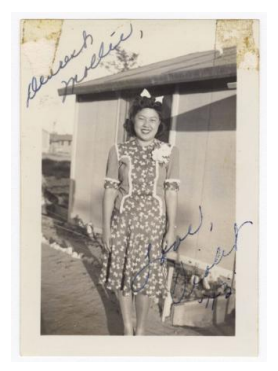
Title: photograph Date: 1943