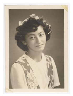
Title: photograph Date: 1943 Medium: paper